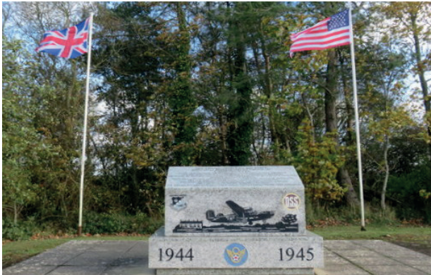
Harrington Airfield Memorial dedicated in 1987