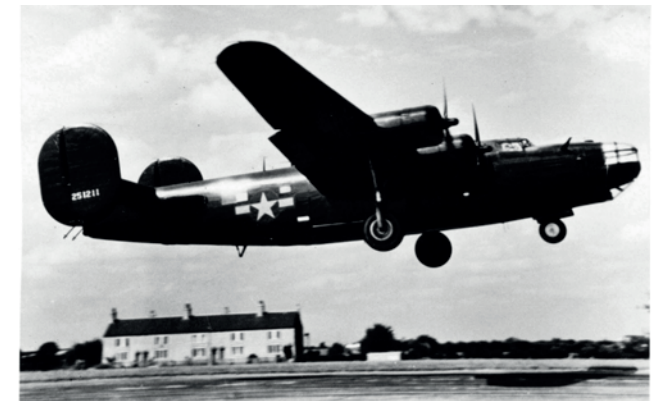
B24 Liberator aircraft (named Miss Fitts), taking off from Harrington in 1944 on a mission to parachute agents and supplies into German Occupied Europe during Operation Carpetbagger