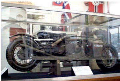
Welbike folding motorcycle used by parachutists during World War 2 on display in the museum

Other displays show the vast secret agent and supply network masterminded by the British Special Operations Executive (SOE) and operated from RAF Tempsford. The part played by the Thor missile base at RAF Harrington (1959-1963) during the Cold War period is also fully described