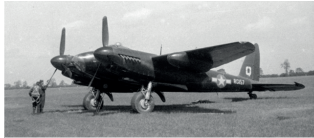
British Mosquito in American markings at Harrington in early 1945. These were used in the Red Stocking / Joan-Eleanor missions that were carried out from Harrington