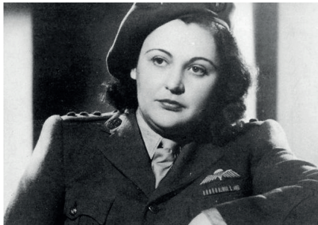
Nancy Wake. The first female agent to be flown from Harrington in April 1944