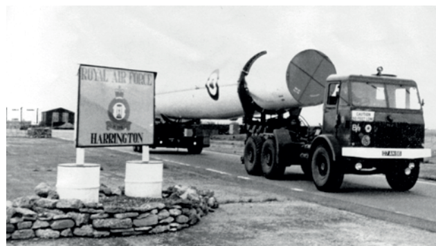
The last Thor missile leaving RAF Harrington in 1963. Thor missiles were the first British nuclear deterrent and were based at Harrington with the 218 (SM) Squadron from 1959—1963