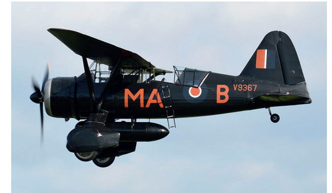
Pick up Lysander aircraft as operated by the RAF's 161 Squadron from the Tempsford and Tangmere airfields

Group bookings are welcome at any other times.